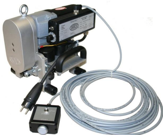
Remote Control K9-1-KF

As an option, the remote control K9-1-KF can be assembled to the seamer. This remote control is ideal to close a panel on the facade or wall, convenient from the ground. It can be used on top of the roof to close barrel curved or vaulted panels. Due to the remote control for forward, stop and reverse operation, the operator can back up the seamer to the starting point, without to proceed to the machine.